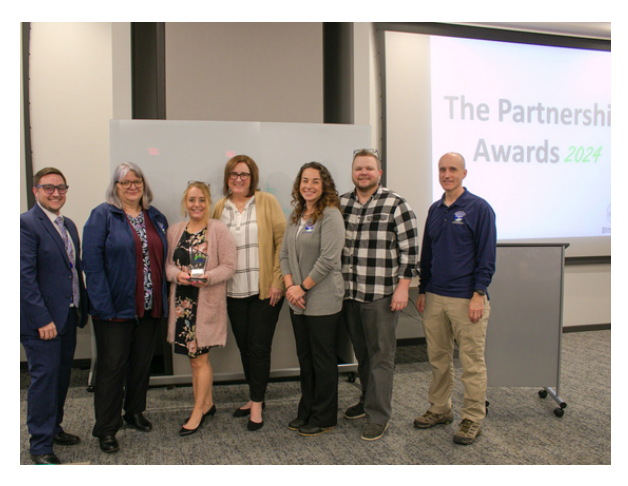
Staff members at DMMHRSB and Maryhaven accepted the Partnership for a Healthy Delaware County's quarterly meeting on March 7.